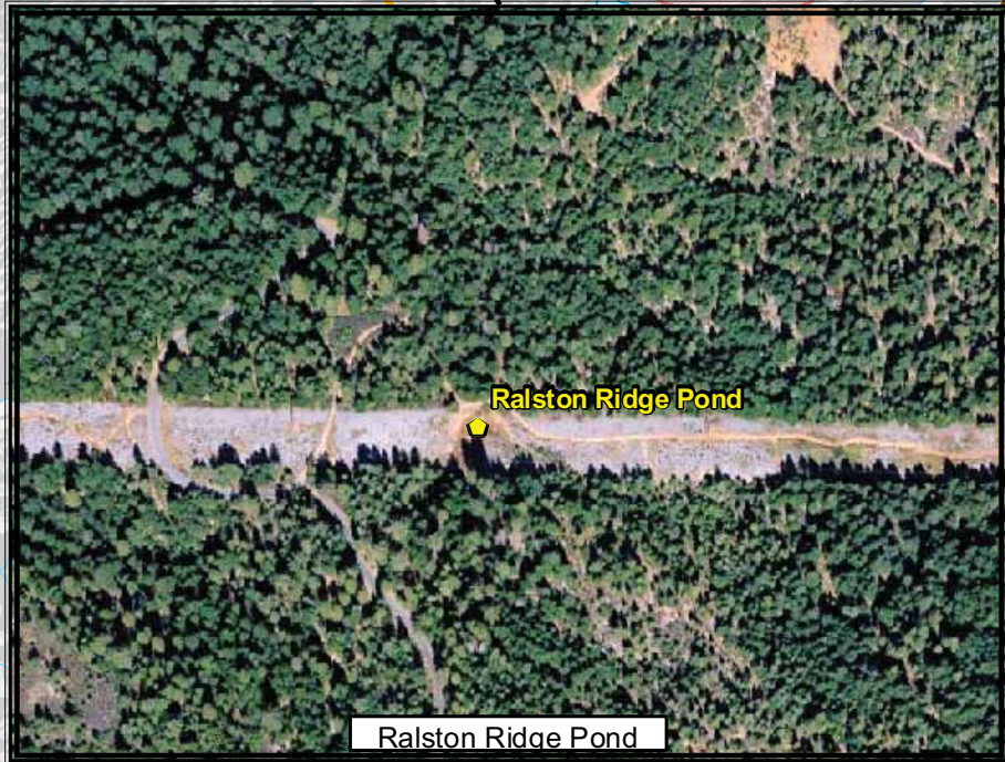
Ralston Ridge Pond